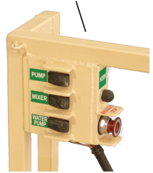
On Board Reserve Water Tank & Pump