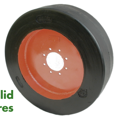
Optional Solid Rubber Tires